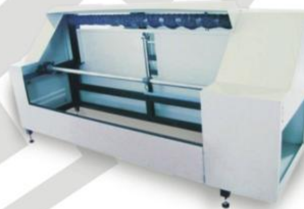
Auto Material Feeder