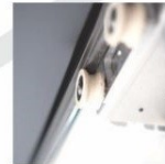
CARRIAGE autonomous, fluid, aluminum double track