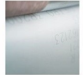
PRINTING accurate, excellent: highest speed