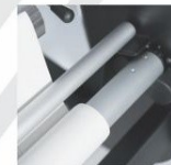
USABILITY fast loading; minor maintenance